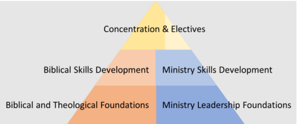
Chart 1. MDiv Curricular Framework