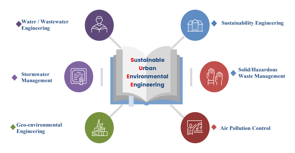
Figure 1. Conceptualization of the concentrated area of the SUEE program

The School of Engineering at Morgan State University (MSU) is proposing the creation of a Sustainable Urban Environmental Engineering (SUEE) Bachelor of Science (B.S.) degree program. This program will provide a leadership role in Maryland's economic and social development by preparing SUEE graduates to join a high-quality educated workforce in an area of national need. The development of a new bachelor's degree in SUEE will contribute to meeting the strategic goals of the university by providing affordable, accessible, and pedagogically structured education and research programs. The formalized degree program will provide vital transformative STEM education and world-changing research opportunities for undergraduate students. The SUEE curriculum trains future engineers to apply their technical understanding to protecting human and environmental health in urban settings. Environmental impacts are a consequence of human development, activities, and the practice of every discipline of engineering. SUEE seeks to educate students across the various sub-disciplines of environmental engineering and will incorporate design, practices, and processes that are harmonious with the Earth's ecosystems.