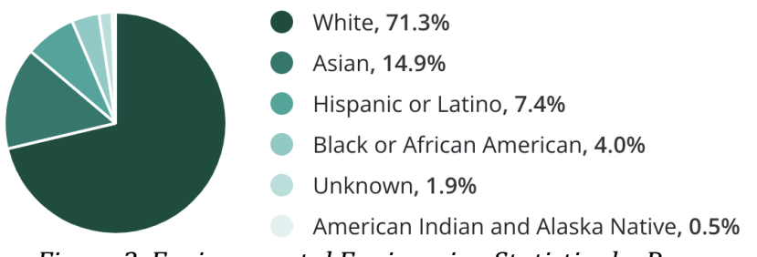
Figure 2. Environmental Engineering Statistics by Race

Traditional areas of engineering disciplines such as chemical, computer, civil, computer science, electrical, and mechanical engineering are readily available at more than 50% of HBIs. While only one HBI program offered an ABET-accredited Environmental Engineering B.S degree in the United States which is Central State University in Wilberforce, Ohio. No public universities including HBIs in Maryland's higher education system offer a separate Environmental Engineering bachelor's degree.