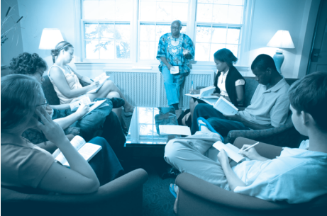
RETENTION AND GRADUATION AT FOUR-YEAR PUBLIC INSTITUTIONS IN MARYLAND